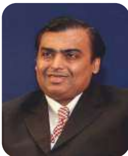
Mukesh Ambani Chairman and CEO, Reliance Industries Limited