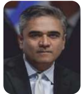
Anshu Jain Co-CEO, Deutsche Bank