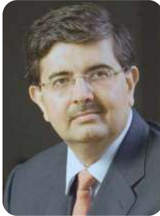
Uday Kotak Vice Chairman & MD, Kotak Mahindra Bank