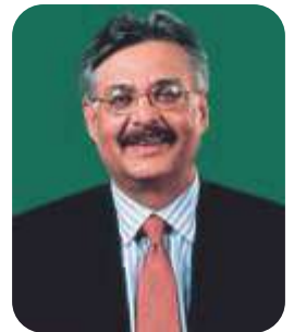
Y C Deveshwar Chairman, ITC Limited