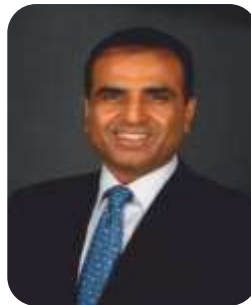
Sunil Bharti Mittal Chairman and Group CEO, Bharti Enterprises