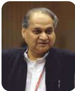
Rahul Bajaj Chairman and MD, Bajaj Group