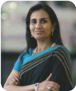
Chanda Kochhar MD and CEO, ICICI Bank