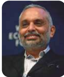
Hari S Bhartia Co-Chairman and Founder, Jubilant Bhartia Group