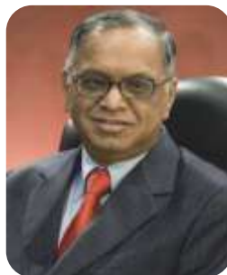
N R Narayana Murthy Chairman Emeritus, Infosys