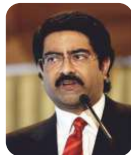
Kumar Mangalam Birla Chairman, Aditya Birla Group