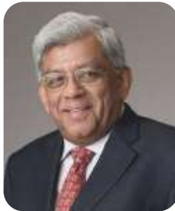
Deepak Parekh Chairman, HDFC