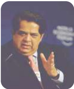
K V Kamath Chairman, Infosys Limited